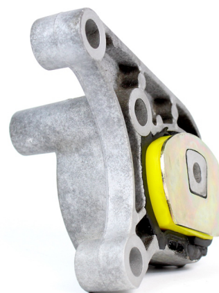
Figure 2: Attach washer to top of insert